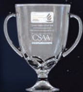
Central Station of the Year

My promise is to be there when you need us. Learn about Rapid Response... The Future of Monitoring.