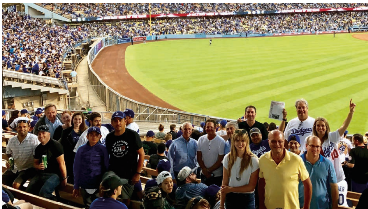
More than 100 Security Industry Professionals attended the GLASAA Dodger Game vs. the Chicago Whitesox.

Please visit our website at www.glasaa.org