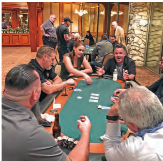
Some of the poker action that raised funds for the 2019 NSA Youth Scholarship Program which will be presented at ISC West.