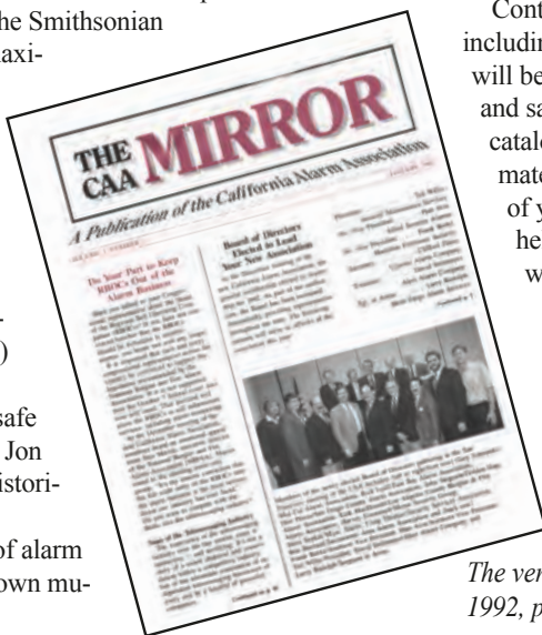
The very first issue of the THE MIRROR, established in 1992, published for the CAA.