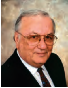
By Harvey Eisenstadt

All too often salespeople will begin a dialog with a prospect by presenting a battery of questions. Unquestionably, some of these questions should be answered before the salesperson gets too deep into their meeting with the prospect. However, in many first call situations this barrage of questions may very well result in one of two very distinct reactions.