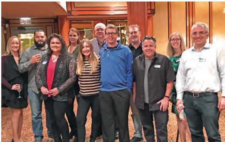
Enjoying the evening at the 2018 NSA Scholarship Fundraiser Poker Party

Join us and see what the power of our association can do. Membership applications available for download from our website www.nevadasecurityassociation.org